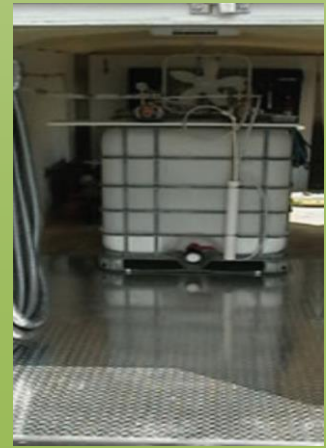
Our Equipment is always evolving as the Technology available becomes more effective and efficient.